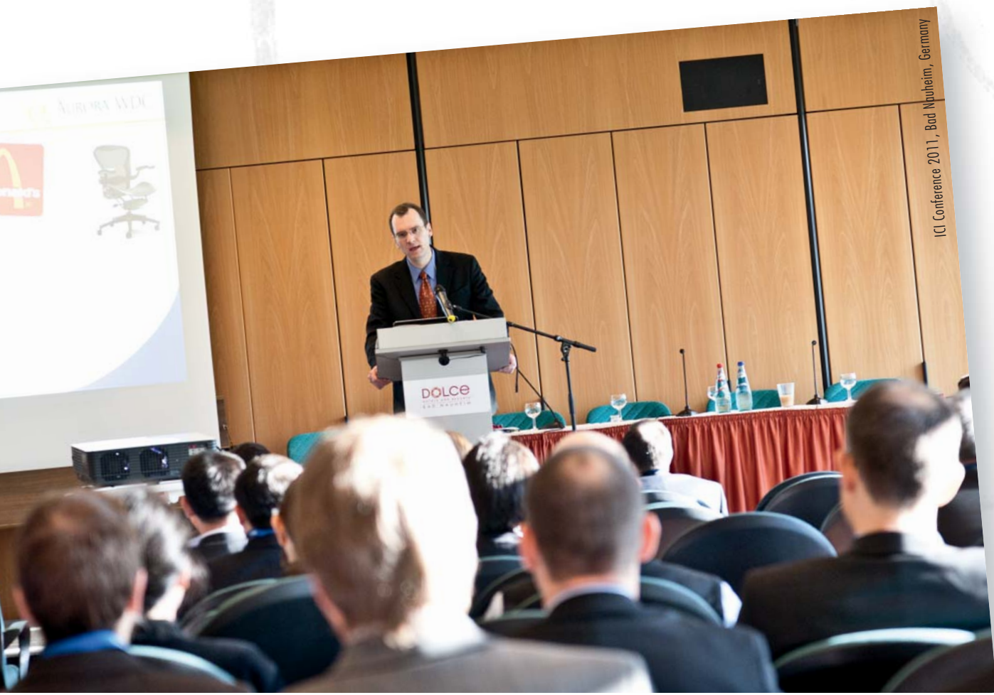
ICI Conference 2011, Bad Nauheim, Germany